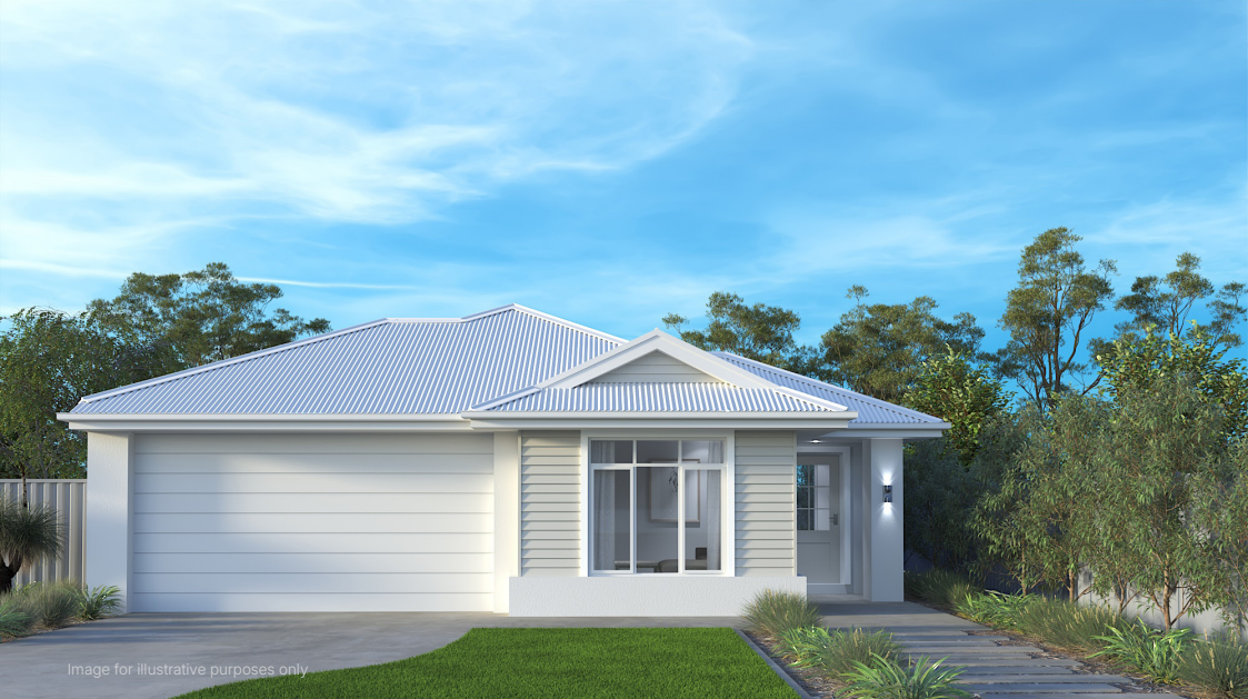
Image for illustrative purposes only