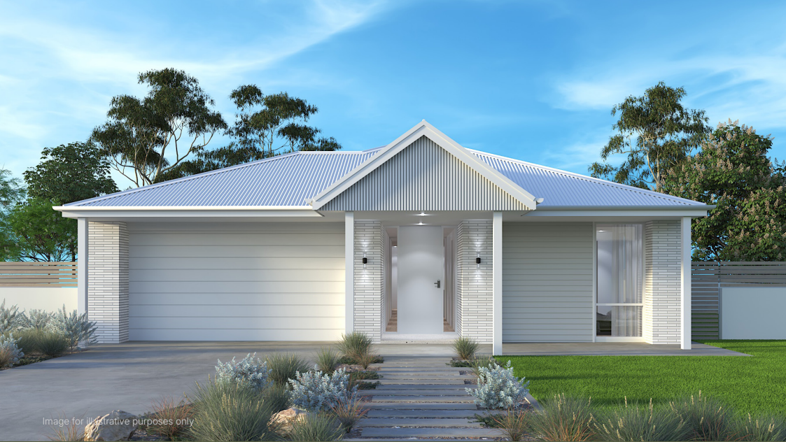
Image for illustrative purposes only