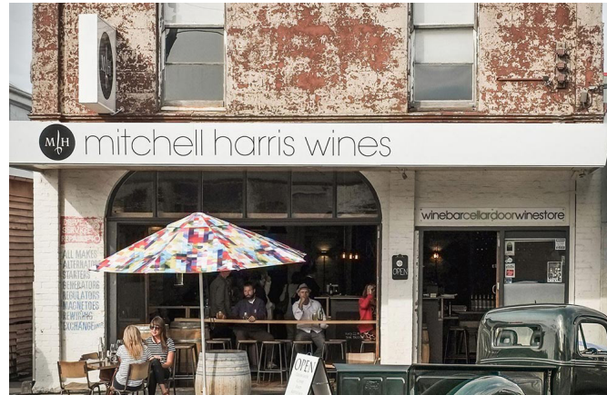
Local Wine: Mitchell Harris Wines