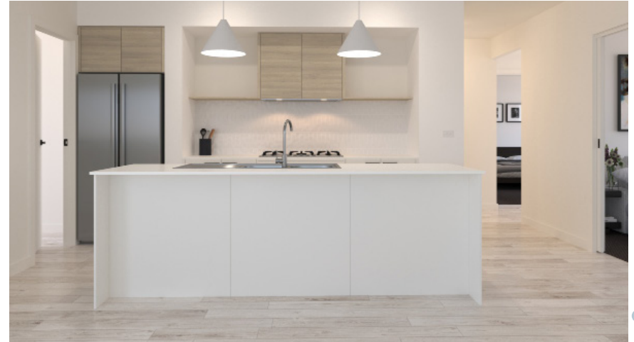
Tonal Scheme Kitchen: Base Cabinetry: Polytec Avion Grey Matt, OHC & Shelf: Polytec Ligurian Walnut WM, Benchtop: SA White Burst* Handles: Jay Artia White 111.33100.001 Tiles: NT19-2200FL vertical brick lay Single bank of drawers to one side of oven.