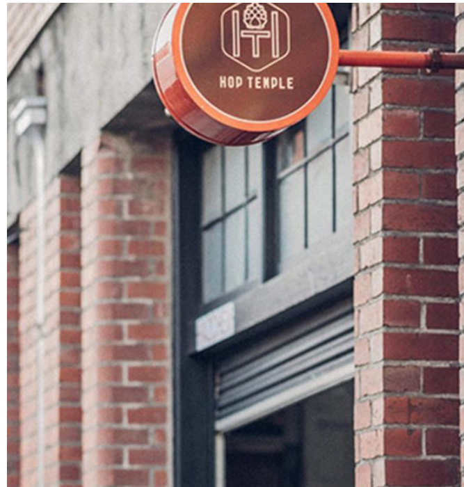
Local Restaurant: Hop Temple