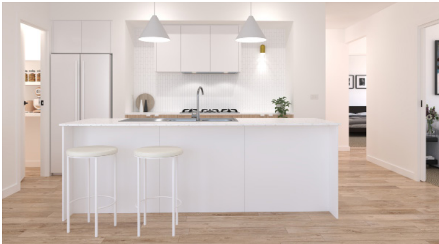
Scandinavian Scheme Kitchen: Base Cabinetry: Formica Snowdrift Velour, OHC: Formica Idyllic Velour, Benchtop: SA White Burst* Handles: Jay Artia Brushed Nickel 111.33100.412 Tiles: 18026 vertical brick lay