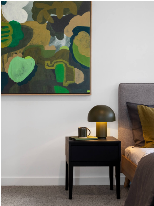
Local Art Scene: Wyatt Art

Known for its history, Ballarat is fast becoming one of the nation's most liveable regional cities. Ballarat has excellent infrastructure, including quality schools, hospitals and Federation University. Couple this with a growing selection of cafes, restaurants and hotels, and it's no surprise that many people are choosing Ballarat as their new place to call home.