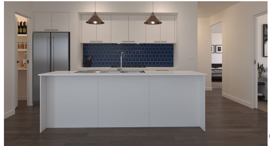
Hamptons Scheme Kitchen: Base & OHC Cabinetry: Formica Warm White Velour, Benchtop: SA White Burst* Handles: SO-3440-160-BN Provincial Brushed Nickel, 128mm to bathrooms. Tiles: SPAWP1043 brick lay