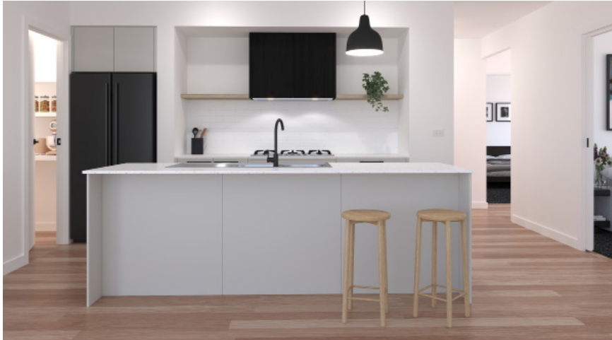
Urban Scheme Kitchen: Base Cabinetry: Formica Seal Grey RH: Polytec Black WM, Floating Shelf: PT Natural Oak Benchtop: SA White Burst* Handles: SO-A-160-BN or BLK Tiles: White Whoosh Matt horizontal brick lay