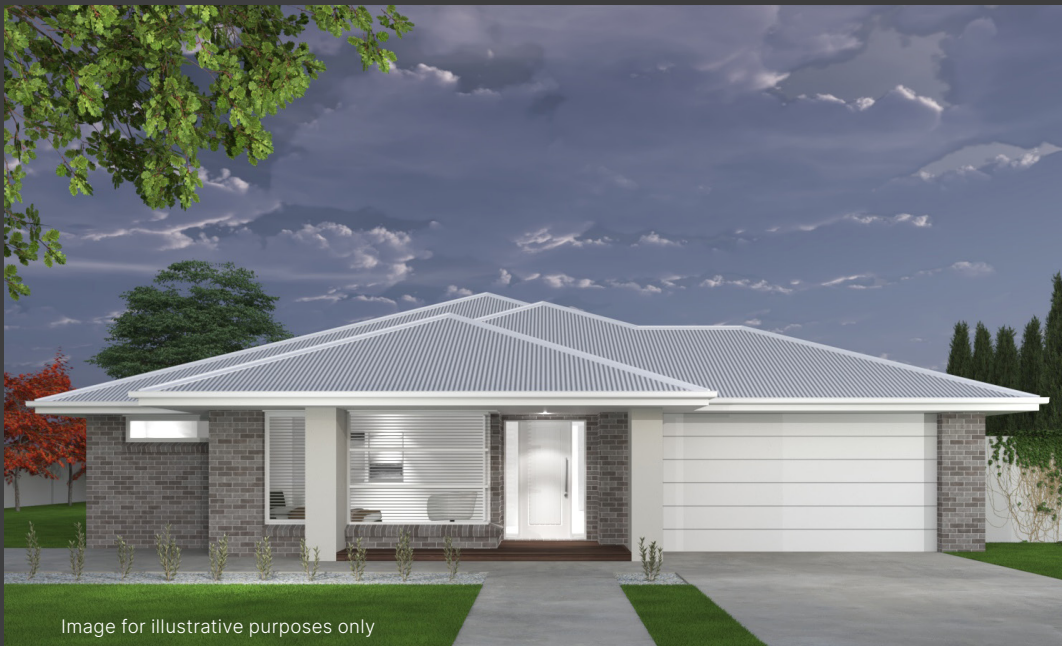
Image for illustrative purposes only