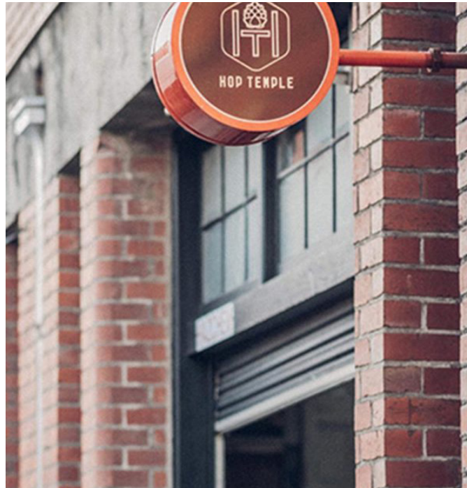
Local Restaurant: Hop Temple