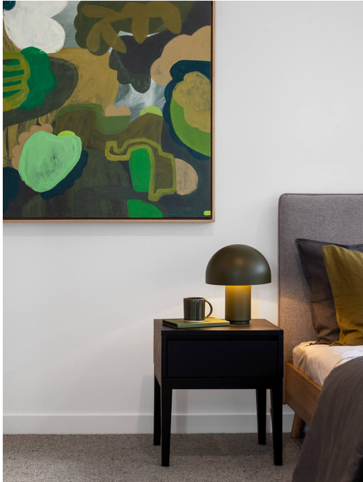
Local Art Scene: Wyatt Art

Known for its history, Ballarat is fast becoming one of the nation's most liveable regional cities. Ballarat has excellent infrastructure, including quality schools, hospitals and Federation University. Couple this with a growing selection of cafes, restaurants and hotels, and it's no surprise that many people are choosing Ballarat as their new place to call home.