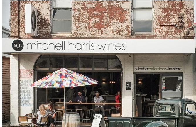
Local Wine: Mitchell Harris Wines