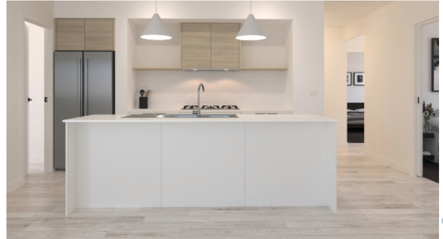
Tonal Scheme Kitchen: Base Cabinetry: Polytec Avion Grey Matt, OHC & Shelf: Polytec Ligurian Walnut WM, Benchtop: SA White Burst* Handles: Jay Artia White 111.33100.001 Tiles: NT19-2200FL vertical brick lay Single bank of drawers to one side of oven.