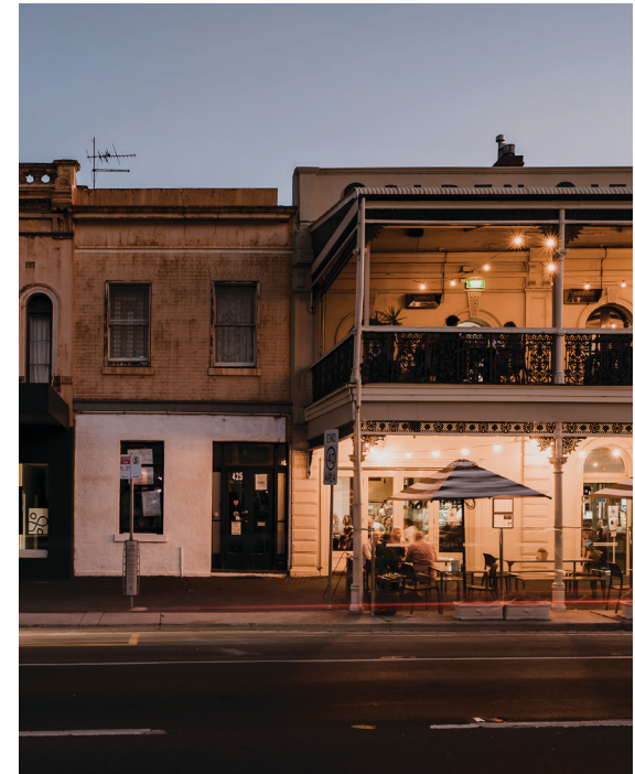
Historical Building: Golden City Hotel