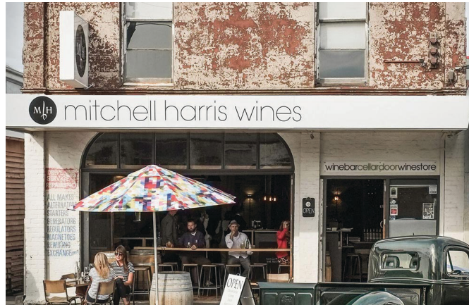
Local Wine: Mitchell Harris Wines