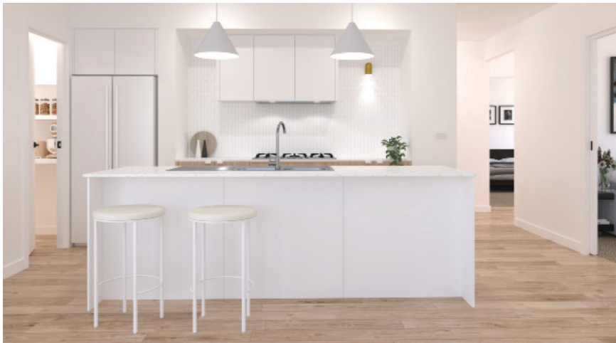
Scandinavian Scheme Kitchen: Base Cabinetry: Formica Snowdrift Velour, OHC: Formica Idyllic Velour, Benchtop: SA White Burst* Handles: Jay Artia Brushed Nickel 111.33100.412 Tiles: 18026 vertical brick lay