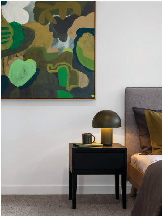
Local Art Scene: Wyatt Art

Known for its history, Ballarat is fast becoming one of the nation's most liveable regional cities. Ballarat has excellent infrastructure, including quality schools, hospitals and Federation University. Couple this with a growing selection of cafes, restaurants and hotels, and it's no surprise that many people are choosing Ballarat as their new place to call home.