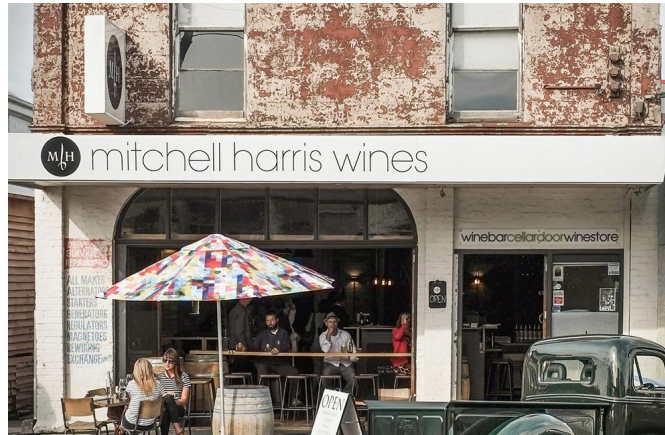
Local Wine: Mitchell Harris Wines