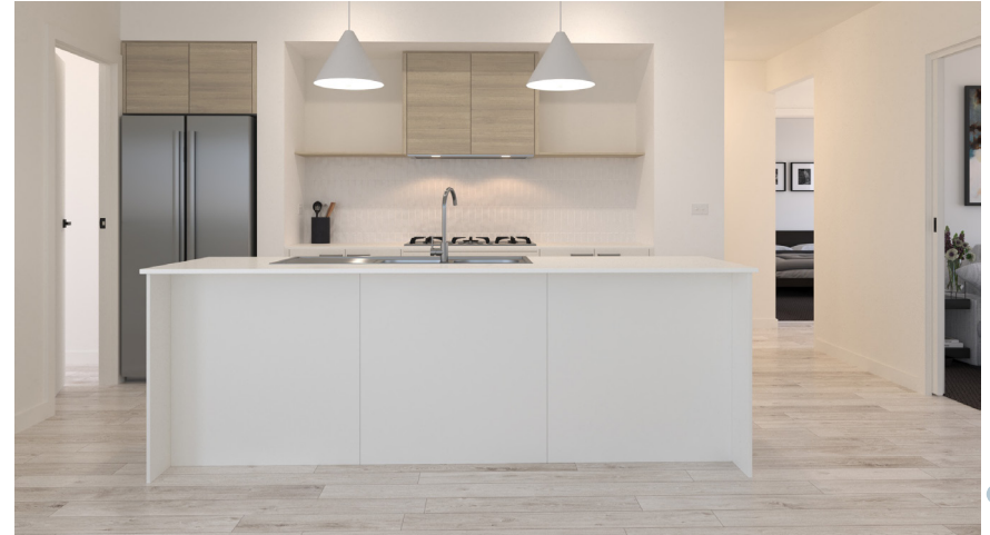
Tonal Scheme Kitchen: Base Cabinetry: Polytec Avion Grey Matt, OHC & Shelf: Polytec Ligurian Walnut WM, Benchtop: SA White Burst* Handles: Jay Artia White 111.33100.001 Tiles: NT19-2200FL vertical brick lay Single bank of drawers to one side of oven.