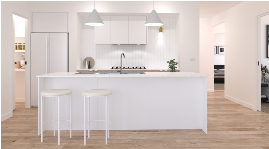
Scandinavian Scheme Kitchen: Base Cabinetry: Formica Snowdrift Velour, OHC: Formica Idyllic Velour, Benchtop: SA White Burst* Handles: Jay Artia Brushed Nickel 111.33100.412 Tiles: 18026 vertical brick lay