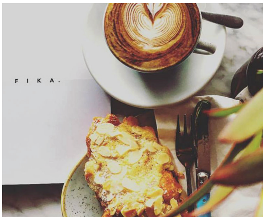
Local Cafe: Fika