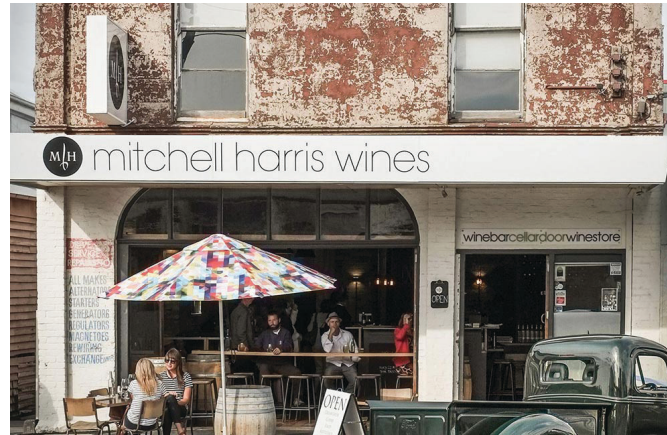
Local Wine: Mitchell Harris Wines