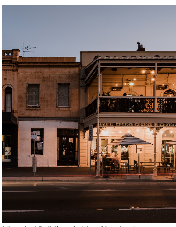
Historical Building: Golden City Hotel