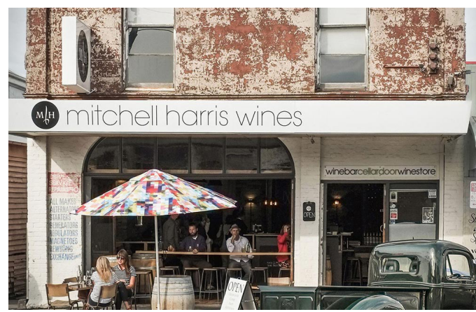
Local Wine: Mitchell Harris Wines