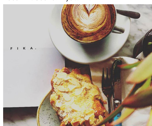
Local Cafe: Fika