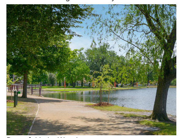
Peaceful Lake Wendouree