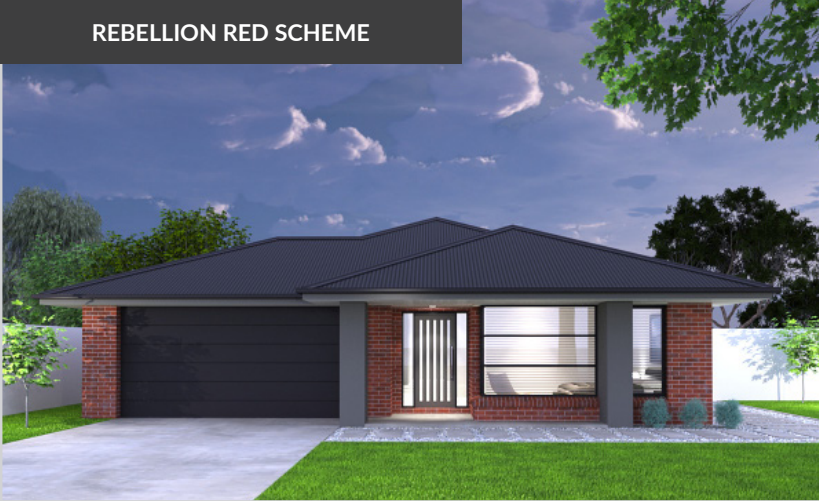
REBELLION RED SCHEME

Monument Roof, spouting, fascia garage & entry door