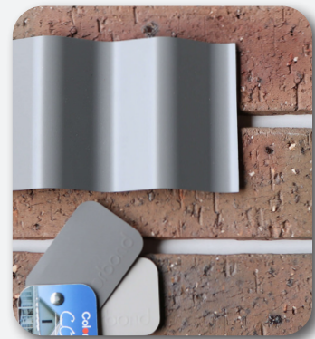
GOLDFIELD HAZE SCHEME