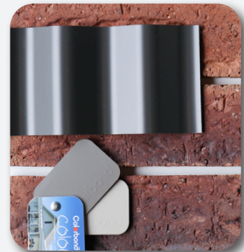
IRONSTONE SCHEME B

Monument Roof, spouting, garage & windows Wallaby Fascia Dune Render & entry door