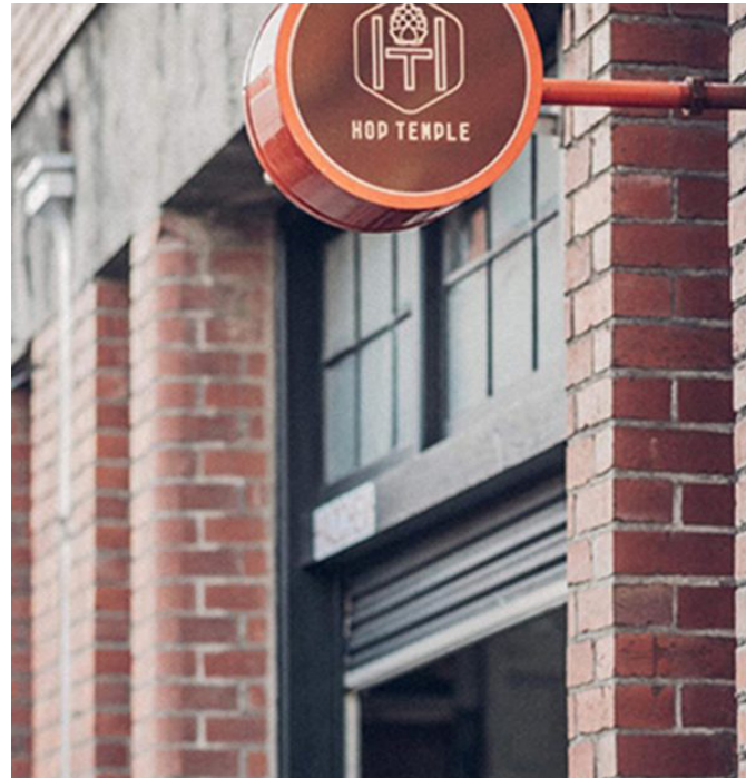
Local Restaurant: Hop Temple