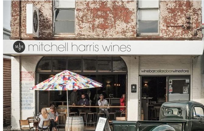
Local Wine: Mitchell Harris Wines