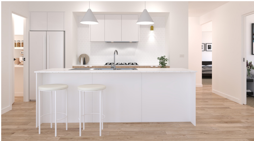
Scandinavian Scheme Kitchen: Base Cabinetry: Formica Snowdrift Velour, OHC: Formica Idyllic Velour, Benchtop: SA White Burst* Handles: Jay Artia Brushed Nickel 111.33100.412 Tiles: 18026 vertical brick lay