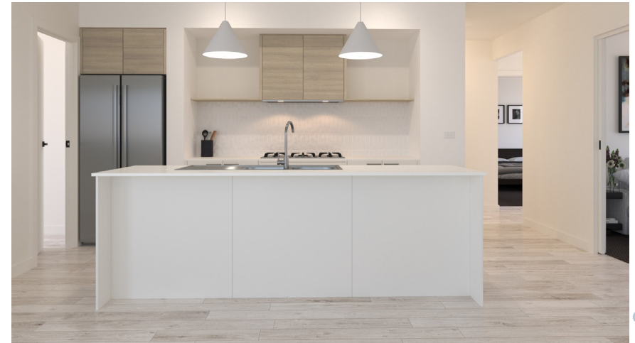
Tonal Scheme Kitchen: Base Cabinetry: Polytec Avion Grey Matt, OHC & Shelf: Polytec Ligurian Walnut WM, Benchtop: SA White Burst* Handles: Jay Artia White 111.33100.001 Tiles: NT19-2200FL vertical brick lay Single bank of drawers to one side of oven.